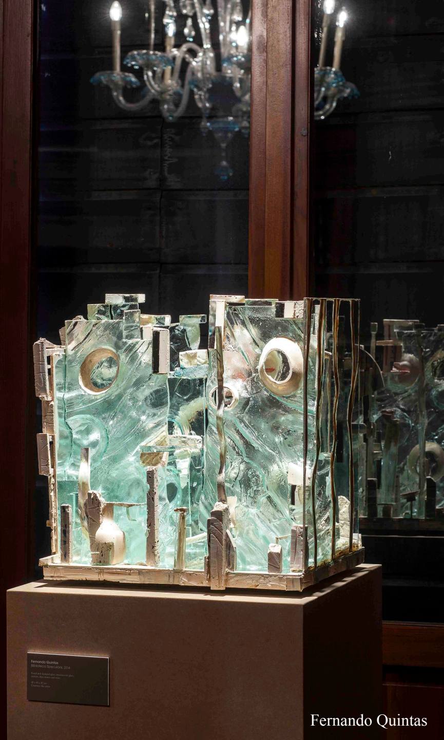
Fernando Quintas Pérez de los Ríos, 2014 Vidrio, metal, aluminio, acero 100 x 100 x 100 cm Edición 1/10